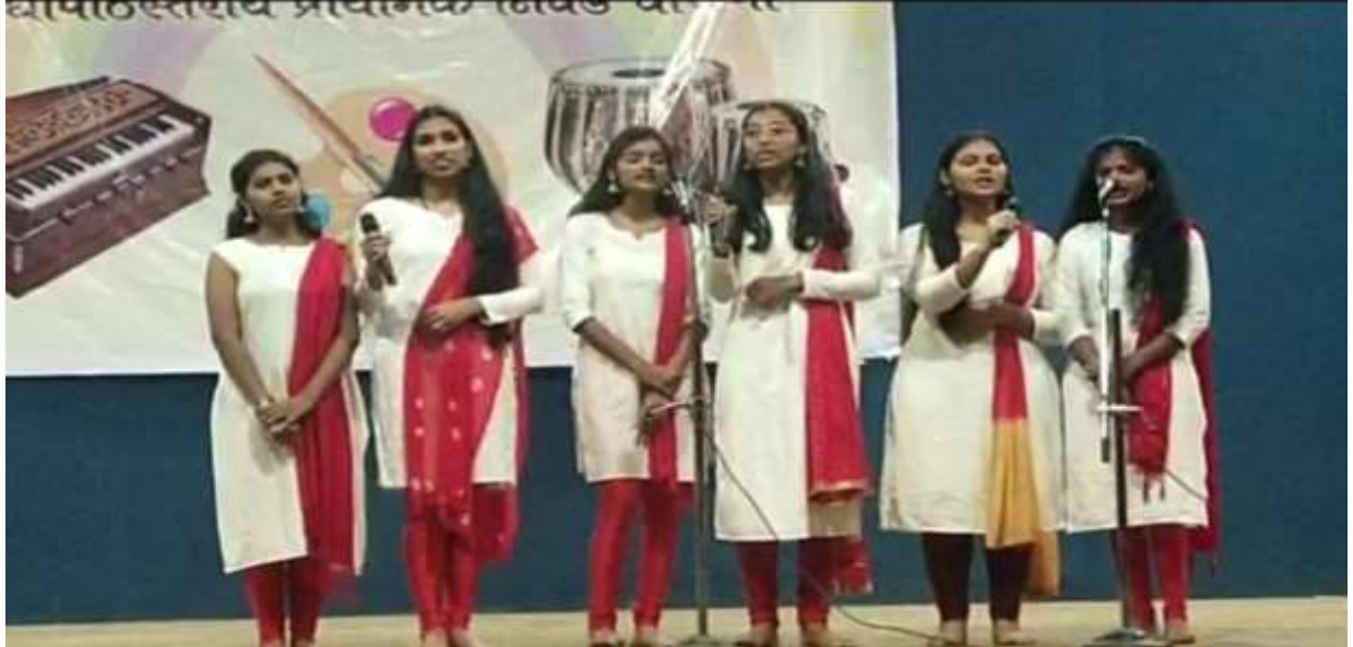
1st prize Indian group song