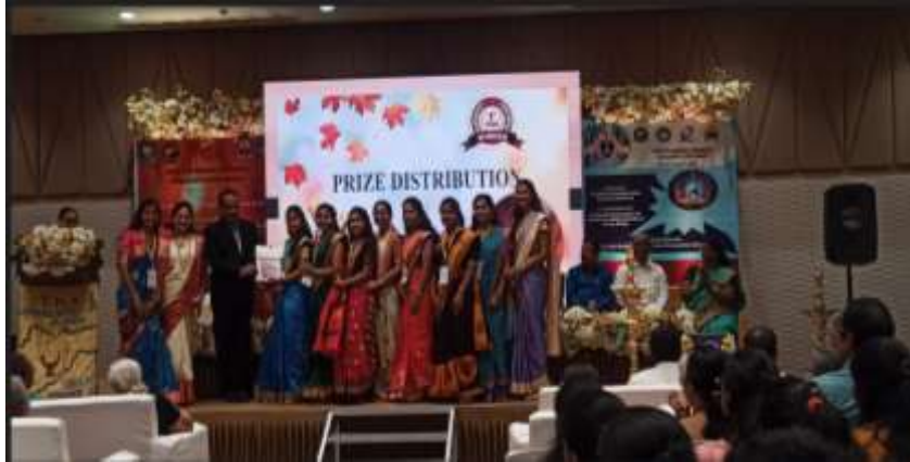
1 st prize Folk dance