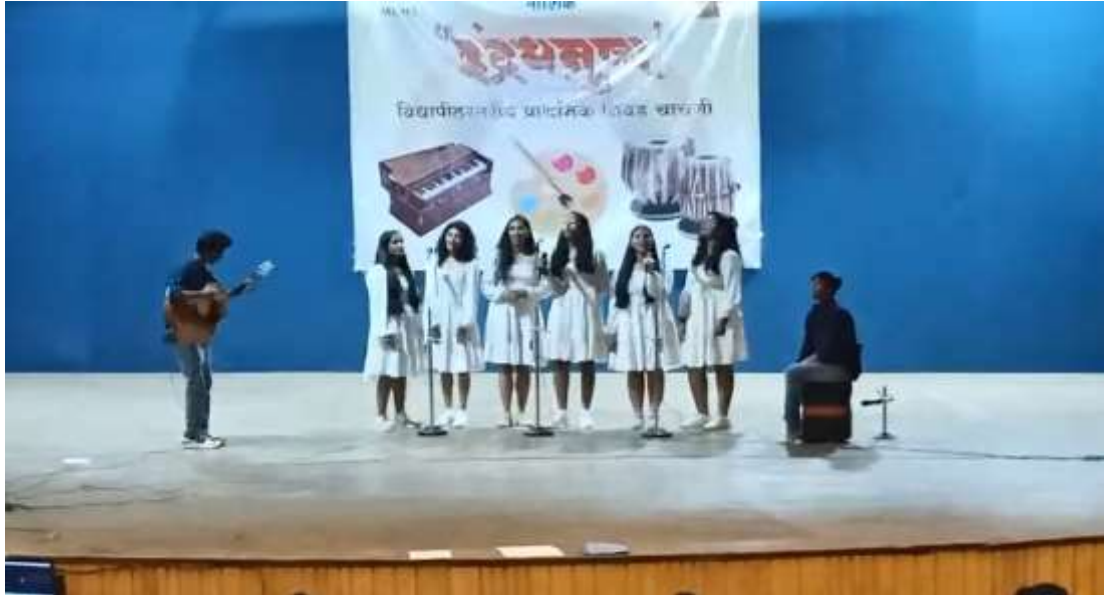
1st prize Western group song