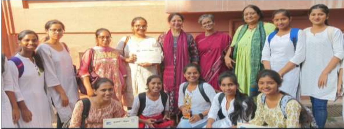
3rd prize Street play